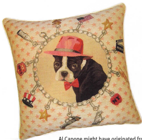
Al Capone might have originated from Chicago, but this European-woven cushion cover is all Boston. $55, artsydog.com

With Mid-century Modern reminiscent lines and adjustable levels to match growth spurts or stiff joints, the Doggy Dining Tray VI has you covered from puppyhood to the golden years. $50, richellusa.com