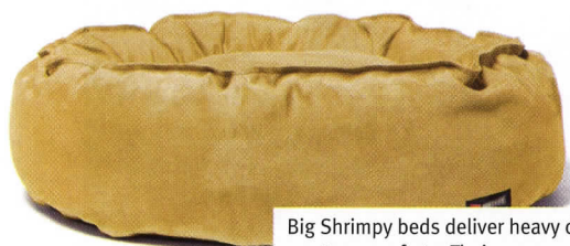
Big Shrimpy beds deliver heavy duty creature comforts. Their super comfy faux suede nest beds are entirely washable and come with a three year warranty. Need further goodness? They're made of 74 percent recycled materials. Sweet dreams. From $120, bigshrimpy.com