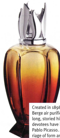
Created in 1898, Lampe Berge air purifiers have a long, storied history. Famous devotees have included Pablo Picasso. A perfect marriage of form and function, these glass lamps destroy uncouth odours like wet dog before emitting delightful fragrance imparted by scented oils. from $44, lampeberger.ca