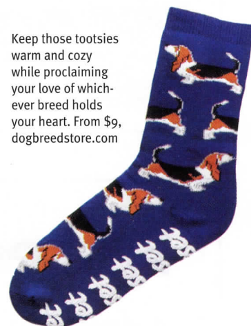
Keep those tootsies warm and cozy while proclaiming your love of whichever breed holds your heart. From $9, dogbreedstore.com

The perfect hostess gift? A bottle of BC's See Ya Later Ranch wine. This winery, which was named for its charming dog-related back story, produces award-winning sippers. From $16, sylranch.com