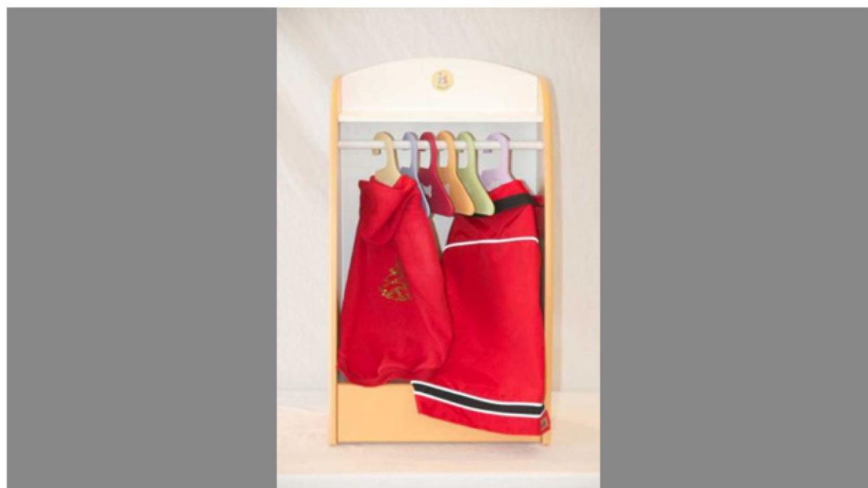
Dog Wardrobe Closet ($89.97) to store your dog's clothes. From DazzleDogDelight.com.