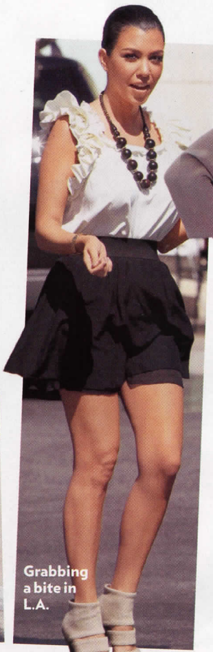
Grabbing a bite in L.A.