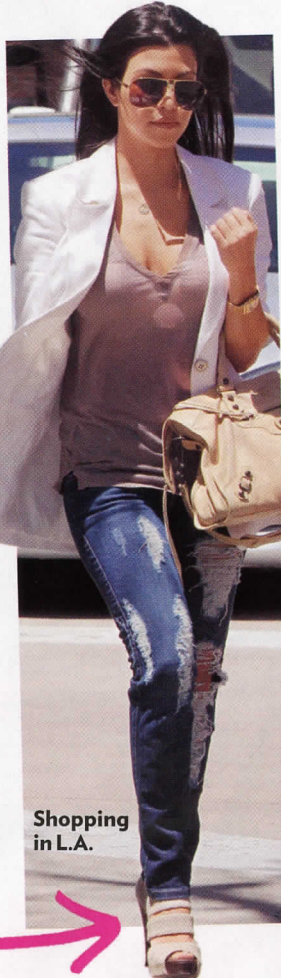
Shopping in L.A.